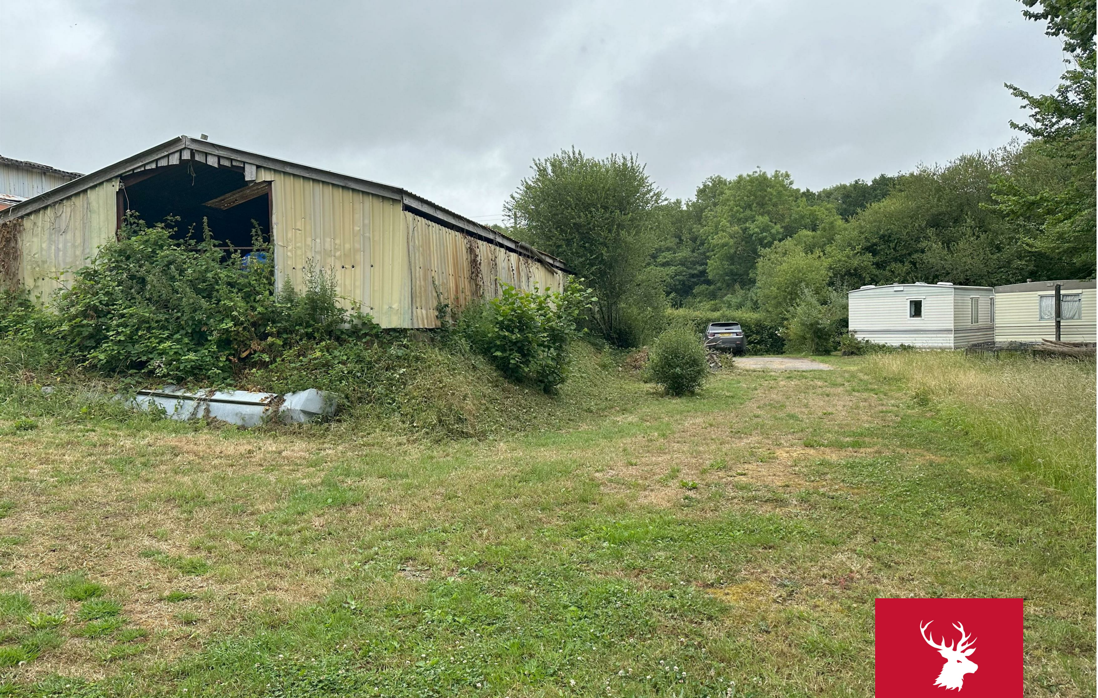
Barns and Caravan at Hornshayes Farm